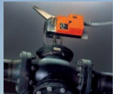
Flanged Globe Valve with GM Series Actuator.