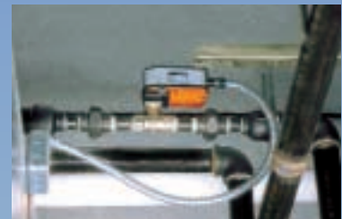
Characterized Control™ Valve (CCV) with LF Series Spring Return Actuator.