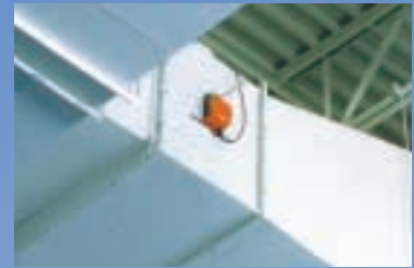
Belimo AM Series Air Damper Actuator – handles a big job for its size.

Belimo provided more than a complete range of control valves and damper actuators for the project, which included butterfly valves, globe valves, and Characterized Control™ ball valves – the most advanced control ball valves in the industry – along with more than 200 actuators. Belimo even came up with unique approaches for mounting the actuators on the outside air dampers.