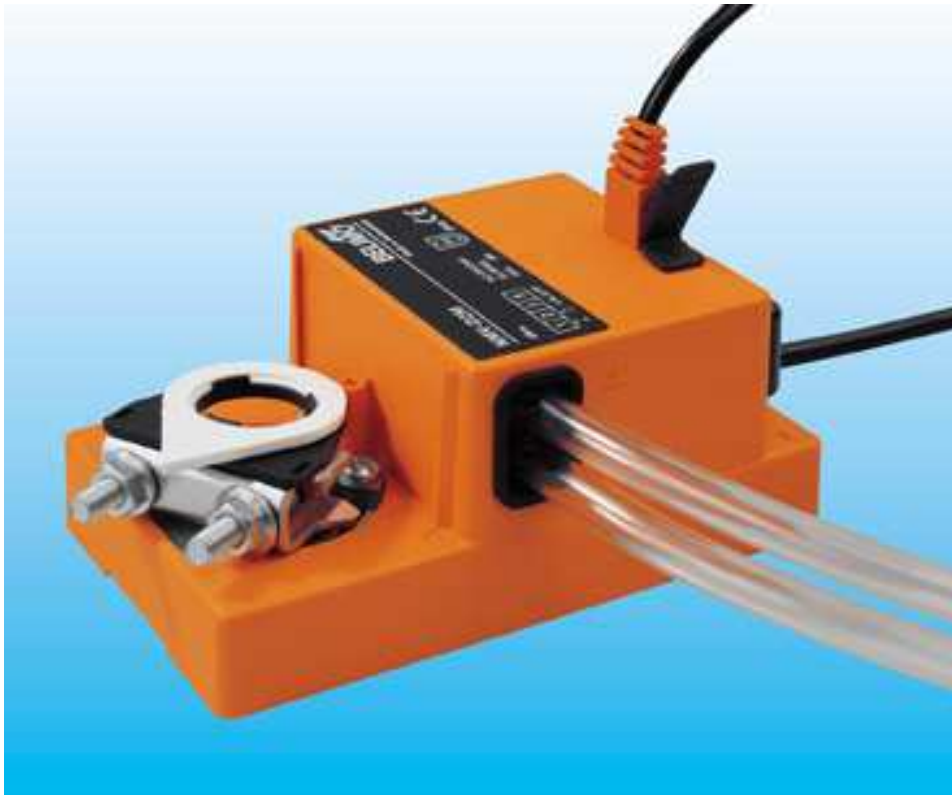
Fig. PR02L_5: Regelkugelhahn

The compact Type NMV-D2M VAV-Compact air volume controller showing its new diagnostic socket