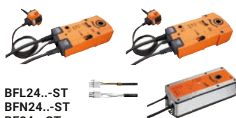
BFL24..-ST BFN24..-ST BF24..-ST