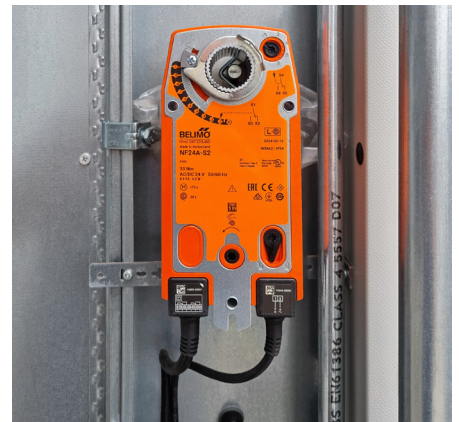
Smart devices like this damper actuator from Belimo ensure a transparent building operation.