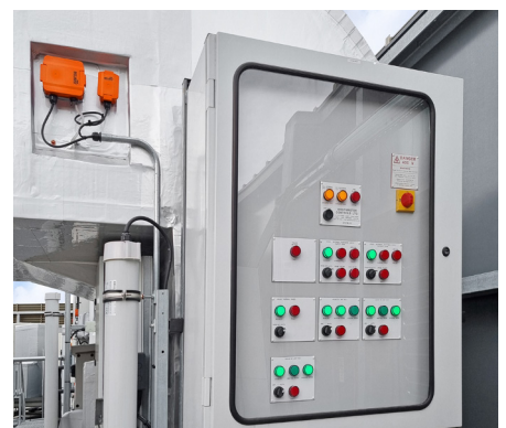
Easy installation and maintenance combined with precise measurement