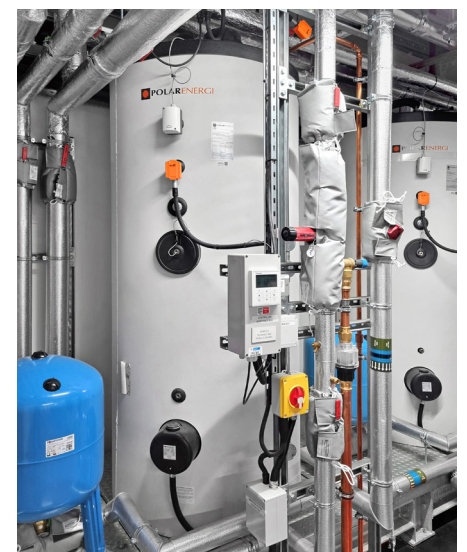
The clear visibility of Belimo sensors simplifies maintenance.

Schematic graphic of the AHU operation in the Daphne Steele building including damper control, filter status, temperature and and CO 2 measurement, and DX controlling status.