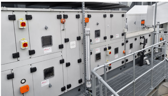
Various field devices from Belimo ensure the smooth operation of the building's AHUs.