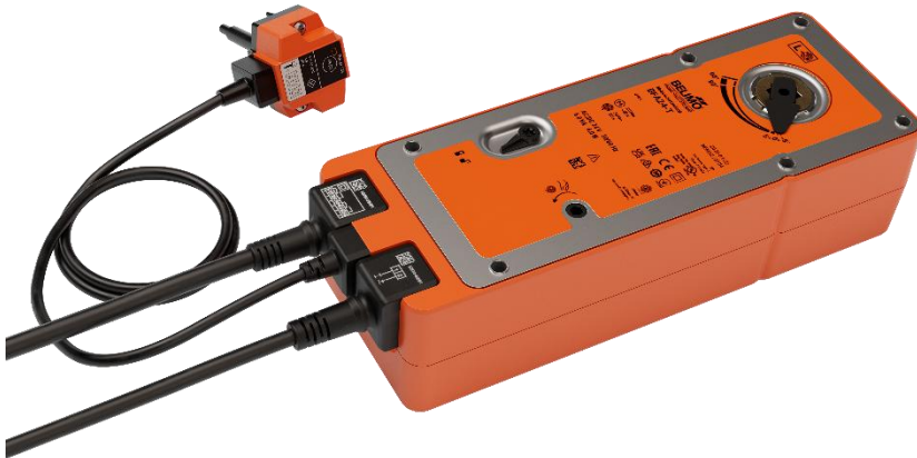
Illustration: BFA230-T, BFA24-SR-T, BFA24-T, BFA24-T-ST, BFA230-T-ST

The BFA series products are similar in physical appearance. Here is an illustration example of a few models from the BFA series: